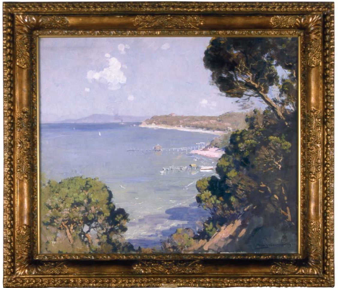
Arthur Streeton, View from Barrett's Point, Portsea , oil on canvas, 1921. University of Adelaide Visual Arts Collection.