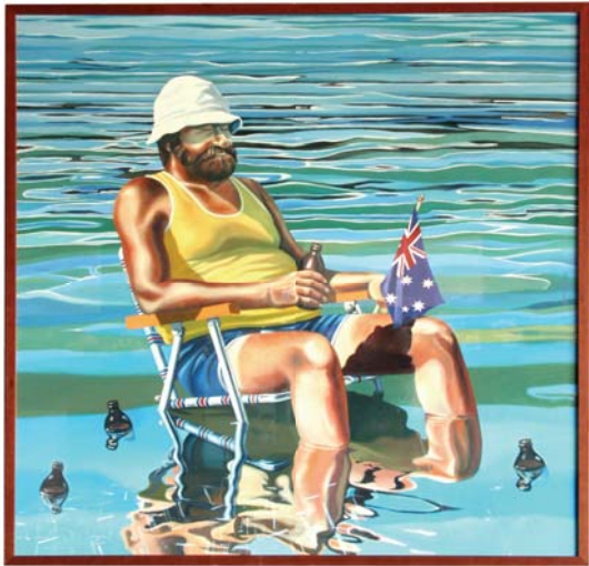
Bill Cook, The Guru , acrylic on canvas, 1981. Adelaide University Union Collection, copyright of the artist.