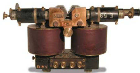
Unknown object, awaiting identification. Scientific Apparatus Historical Collection, University of Adelaide.