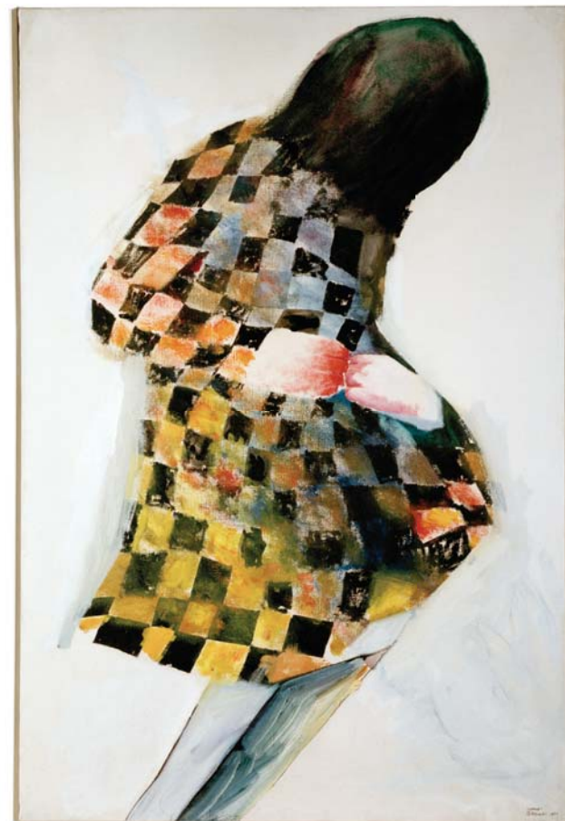
Charles Blackman, Chequered Dress , oil on canvas, 1964. Adelaide University Union Collection, copyright of the artist.