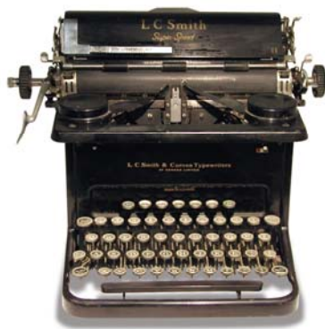
Typewriter, awaiting further research. University of Adelaide Historical Collection.