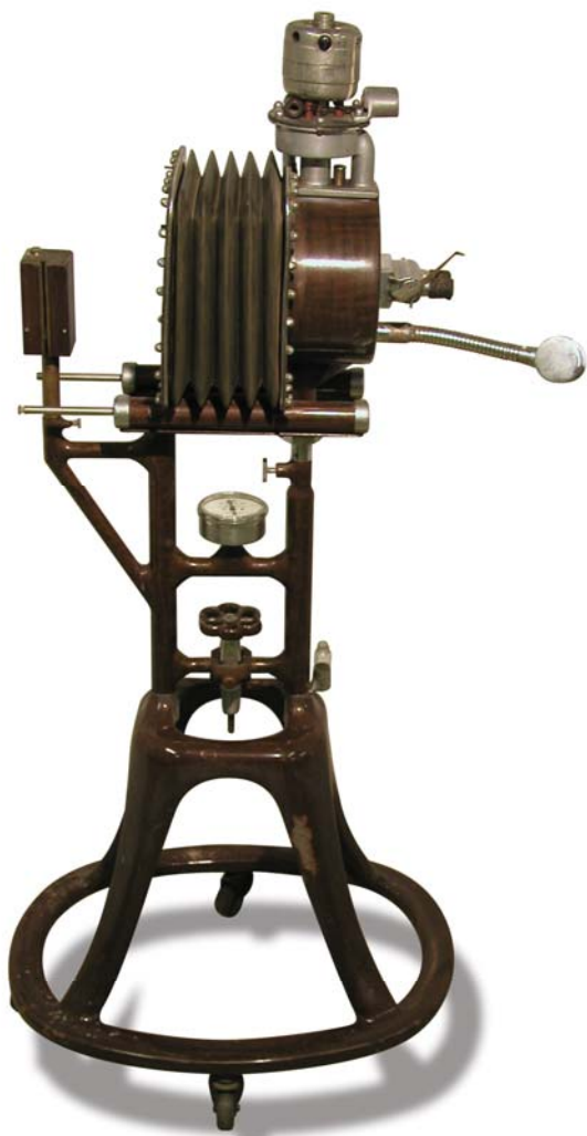
Unknown object, awaiting identification. Scientific Apparatus Historical Collection, University of Adelaide.