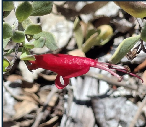
Eremophila sp. Emu Bush. Small shrub