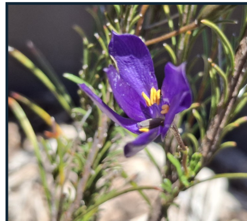
Cheiranthra alternifolia Clustered Finger-Flower. Shrub