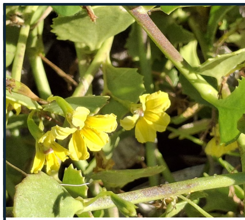
Goodenia varia Sticky Goodenia. Groundcover