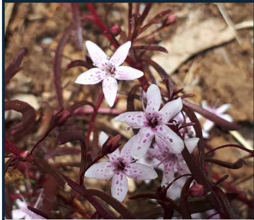
Myoporum parvifolium 'Purpurea' Purple Creeping Boobialla. Groundcover