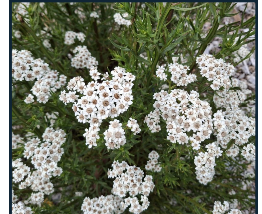
Ixodia achillaeoides Hills-Daisy. Small shrub