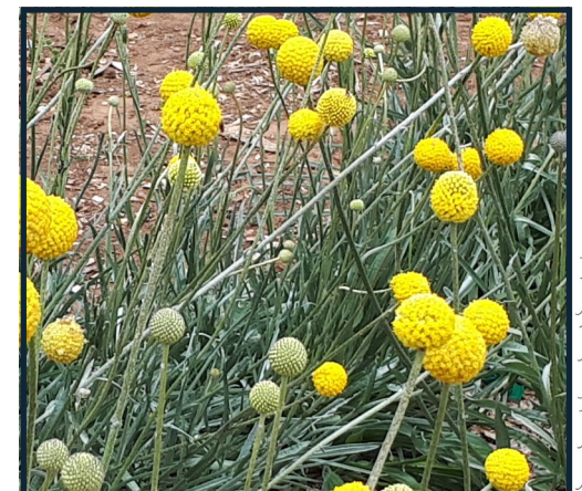
Pycnosorus globosus Billy Buttons. Perennial herb