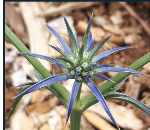
Eryngium ovinum Blue Devil. Perennial herb