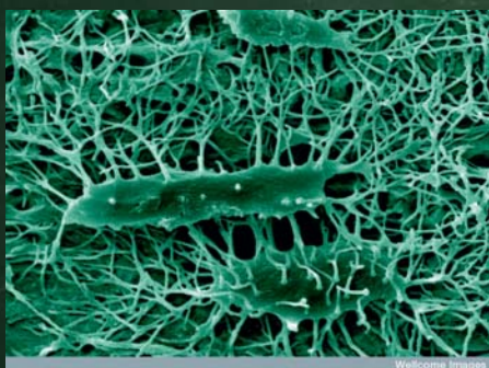
FIGURE 1. Electron microscopic image of resin-embedded and acid-etched rat bone, showing the highly-interconnected 'caves and tunnels' inhabited by osteocytes.

The third element of the scheme which the team has been researching is pre-osteocytes, juvenile cells that occur near the surface of the bone and are affected strongly by sclerostin. Pre-osteocytes are connected to surface osteoblasts, and have the critical role of incorporating inorganic mineral into the bone matrix in order to form bone of the appropriate strength and stiffness. Thus osteocytes, buried deep within the bone matrix are able to affect pre-osteocytes