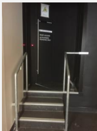
Roof access door

Take public lift to level 4, on exiting lift turn left, you should be facing door 410. Turn right and approximately 10 metres on your left you will see a Fire Safety Door. Then climb stairwell to level 5, you will come to a locked door. Phone security on 83135990 who will release the door (do not hang up). Turn right and once you have reached the roof access door, security will release the door.