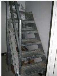
Stairs to doors