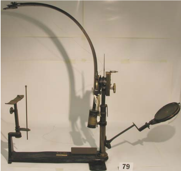
J.Weiss & Son, London Perimeter , 1942 72.5 x 82.0 x 18.0 cm (extended)