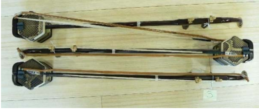
Erhu Wood, plastic, snakeskin 82.0 x 14.0 cm (each instrument)

The University of Adelaide Heritage Music Collection H.HM.2009.3