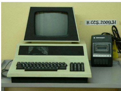
Commodore Business Machines, Inc. Computer, Commodore 4008-N (with tape deck), c.1978 Plastic, glass, metal

The University of Adelaide Computing and Computing Science Collection H.CCS.2009.50