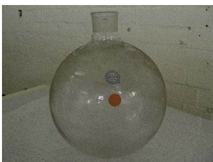
Quickfit & Quartz Flask, round bottom borosilicate glass

This small, early model Commodore computer was used in the School of Chemistry & Physics at the University. It is accompanied by a monochromatic monitor and tape player for loading computer programs via cassette tape. The 4008-N was a PET (personal electronic transactor) and one of the first computers used for general purpose lab experiments and data logging, from its purchase in the late 1970s until nearly 2000.