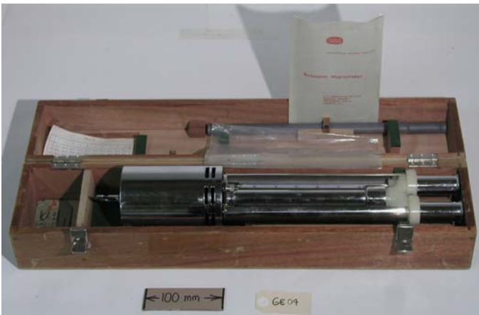
C.F. Casella & Co. Assmann Hygrometer

The electroscope detects and measures voltage or static electricity. A metal disc is connected to a narrow metal plate and a thin piece of gold leaf is fixed to the plate. A Faraday cage is used to stop electromagnetic fields. Also called a shield, it may be created by continuous covering of conductive material (shield) or a mesh of conductive material (cage). Named after the Michael Faraday, they are employed to safeguard sensitive electronic equipment from external radio frequency interference.