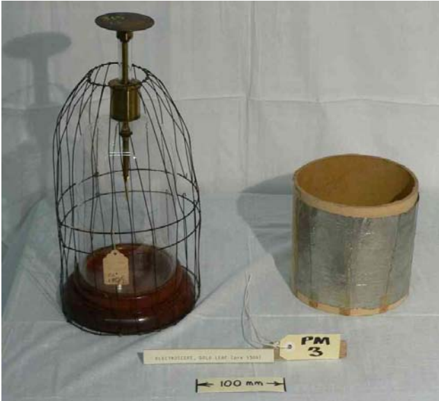
Gold leaf electroscope (with Faraday cages)

A single draw containing six microscope slides on which thin cross-section of plant material have been placed. The labels indicate the slides come from several sources including an external supplier in Manchester, England, while one hand-written label demonstrates the longevity of this teaching resource. Plants on the slides are Tradescantia , Elm, Ginkgo Biloba, the lichen Chondropsis semiviridis , Clematis and Poplar.