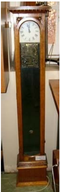
Clock - Electric