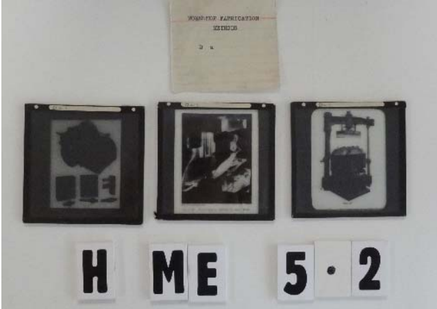
Engineering teaching slides

This perimeter, one of two in the Scientific Apparatus collection that were originally a part of the University's Historical Collections Repository (Physiology), was used in determining a person's field of vision or if they had a blind spot. It was made by J.Weiss & Son, a well-known English manufacturer of surgical and other medical instruments.