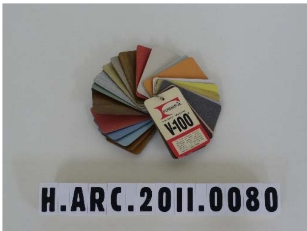
Formica Group Samples, formica paper and melamine resin 10.0 x 6.0 x 3.0 cm

The University of Adelaide Architecture Collection H.ARC.2011.80