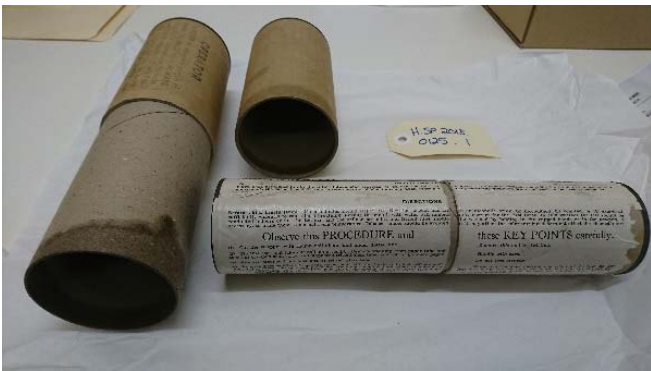
Intoximeter Associations Intoximeter Paper, card, metal, plastic, rubber, string, glass 23.0 x 6.5 x 6.5 cm (external tube)

The erhu is a two-stringed bowed musical instrument (or spike fiddle) sometimes known as the Chinese violin. It is used as a solo instrument as well as in small ensembles and large orchestras, in both traditional and contemporary music. These three instruments, with accompanying cases, are on display in the Confucius Institute and were from the Shandong University.