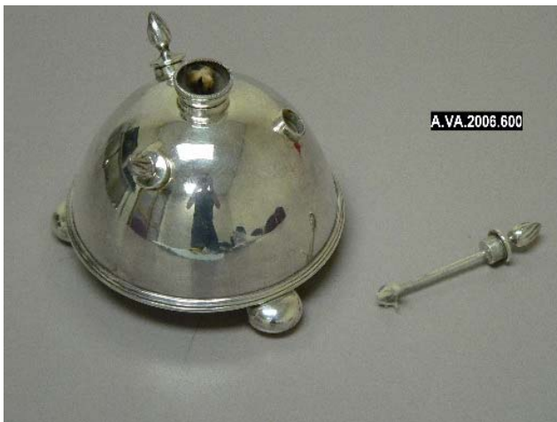
Unknown Maker EPBM Heater/Burner Base Electroplated Britannia Metal 7.5 x 16.0 x 16.0 cm

What sorts of objects might we be writing about? The objects below are but a few from the University's diverse collections.