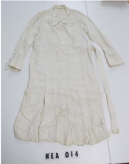
Charles Birk Co., Ltd. Nurse's Uniform Cotton 80.0 x 57.0 cm

The University of Adelaide Health Sciences Collection H.HEA.2015.14