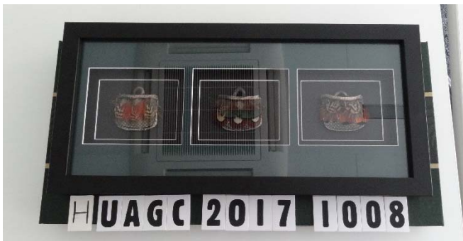
MADINZ Kete (Baskets of Knowledge) Flax, feathers and clay 20.0 x 42.0 x 3.0 cm (framed)