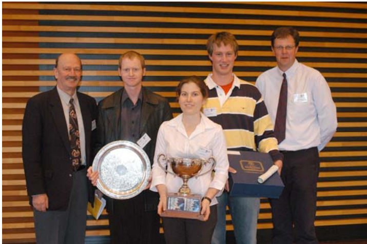
ROCA's three prize winners at the ceremony